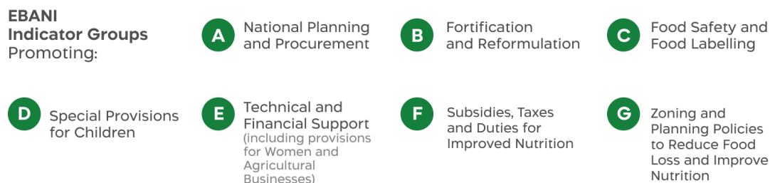
Figure 1: EBANI Indicator Groups

EBANI is a collection of 22 indicators covering seven groups, each aimed at classifying the country-based policies that promote key aspects of an enabled nutrition and business environment (Figure 1, below):