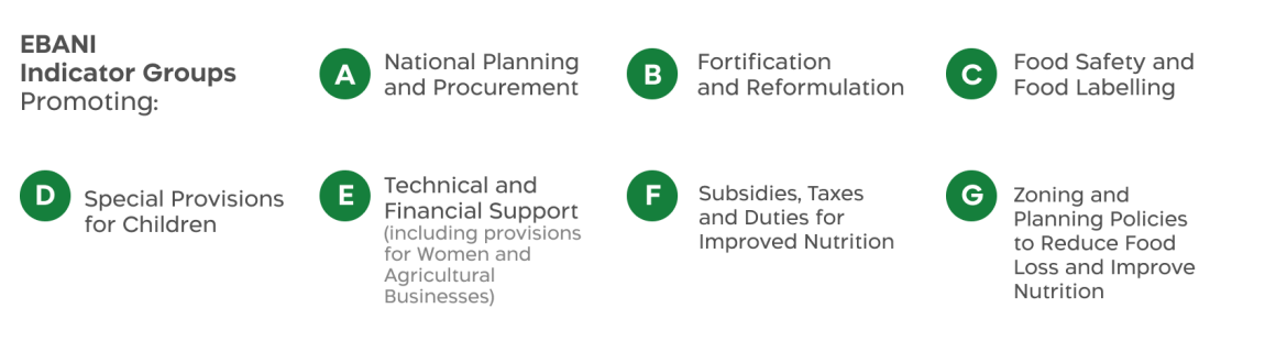
Figure 1: EBANI Indicator Groups

EBANI is a collection of 22 indicators covering seven groups, each aimed at classifying the country-based policies that promote key aspects of an enabled nutrition and business environment (Figure 1, below):